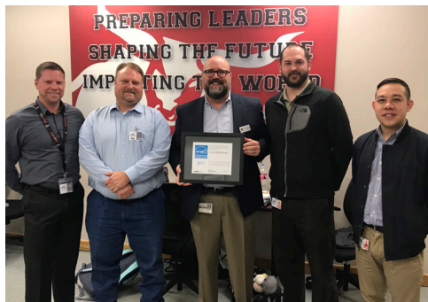
Energy Star Certification Lamar Middle School