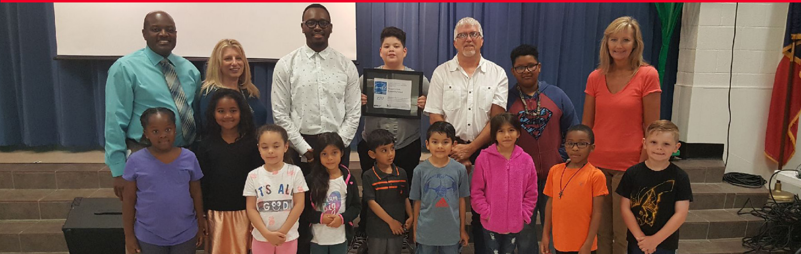
Energy Star Certification - Stewart's Creek Elementary School