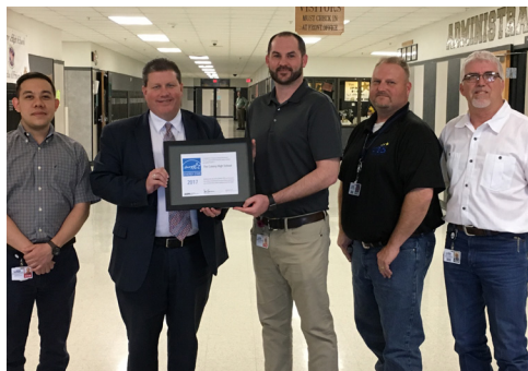
Energy Star Certification The Colony High School

To earn ENERGY STAR Certification, the U.S. EPA's recognition of superior energy efficiency, buildings must perform in the top 25 percentile of similar buildings nationwide. At LISD, Aramark certified 62 of 64 eligible schools resulting in a 98% certification rate and have earned 75 total certifications. ENERGY STAR Certification provides third-party validation of energy efficiency improvements and helps build school pride. LISD's partnerships with Aramark Engineering Solutions (ES), has helped direct more money into the classroom while reducing environmental impacts.