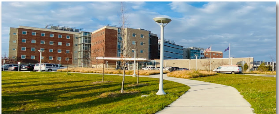
South Beach Psychiatric Center, Staten Island, New York