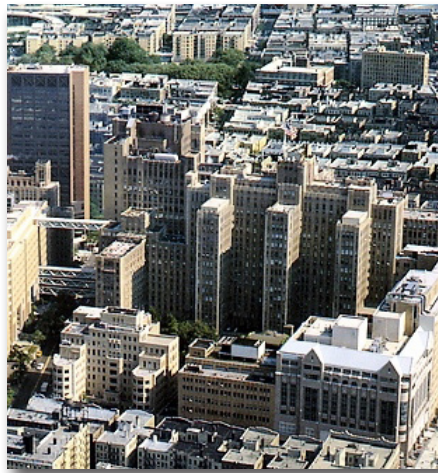
New York Presbyterian - Columbia University Irving Medical Center Campus