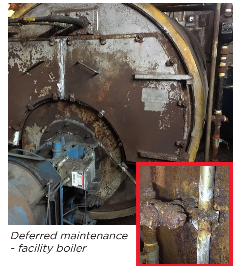
Deferred maintenance - facility boiler

Aramark has more than 30 years of experience providing facility assessment services to its clients. The Aramark Engineering Solutions (ES) team leverages its strategic facility planning experience, along with its operator's perspective, to understand a facility owner's deferred maintenance and modernization needs, and develops tailored solutions to drive their business forward.