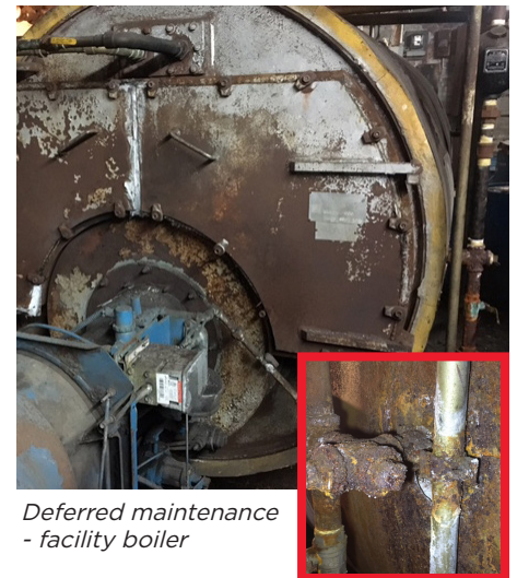
Deferred maintenance - facility boiler

Aramark has more than 30 years of experience providing facility assessment services to its clients. The Aramark Engineering and Asset Solutions (EAS) team leverages its strategic facility planning experience, along with its operator's perspective, to understand a facility owner's deferred maintenance and modernization needs, and develops tailored solutions to drive their business forward.